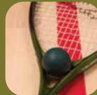
World Squash Federation Approved Size Court