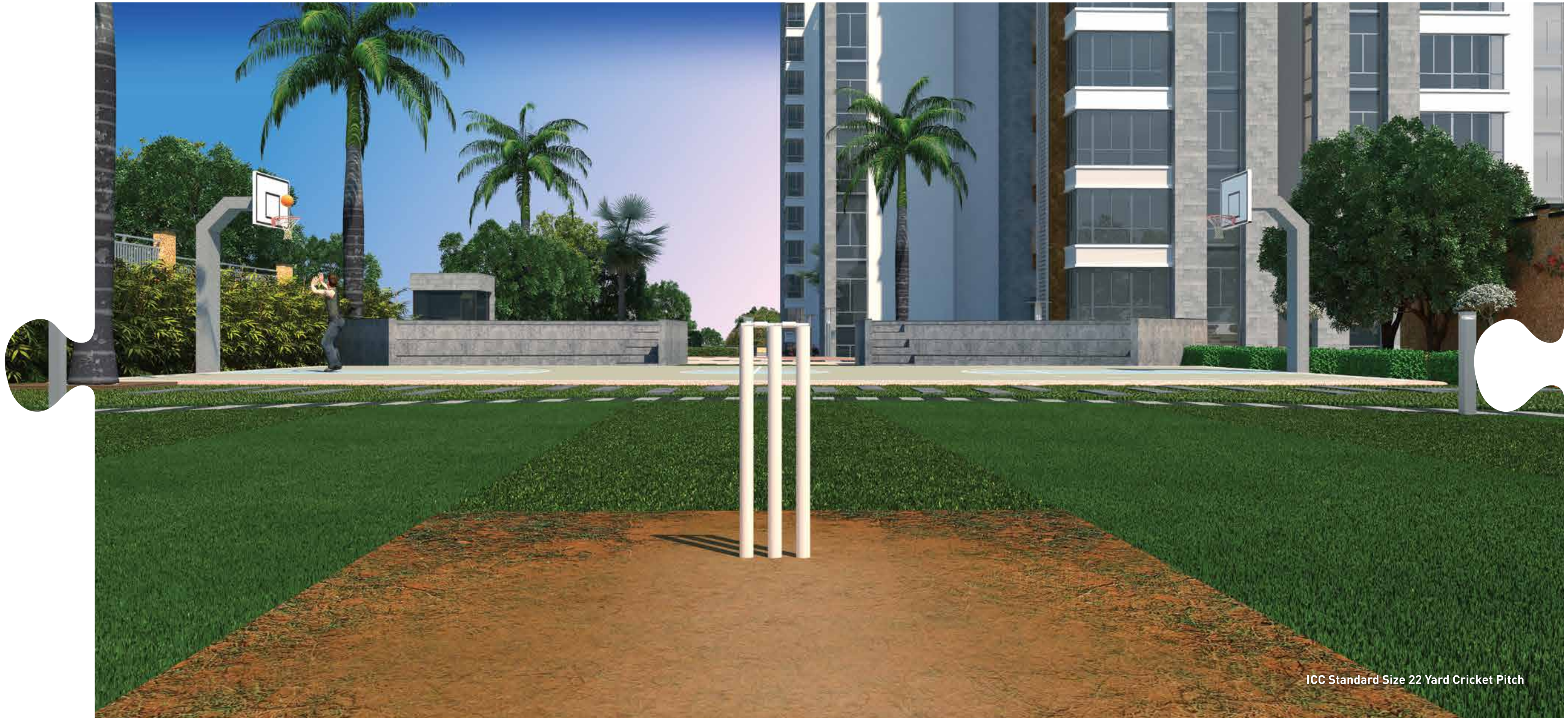
ICC Standard Size 22 Yard Cricket Pitch