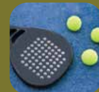
Paddle Tennis Court