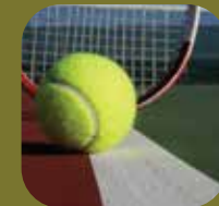
International Tennis Federation Approved Size Court