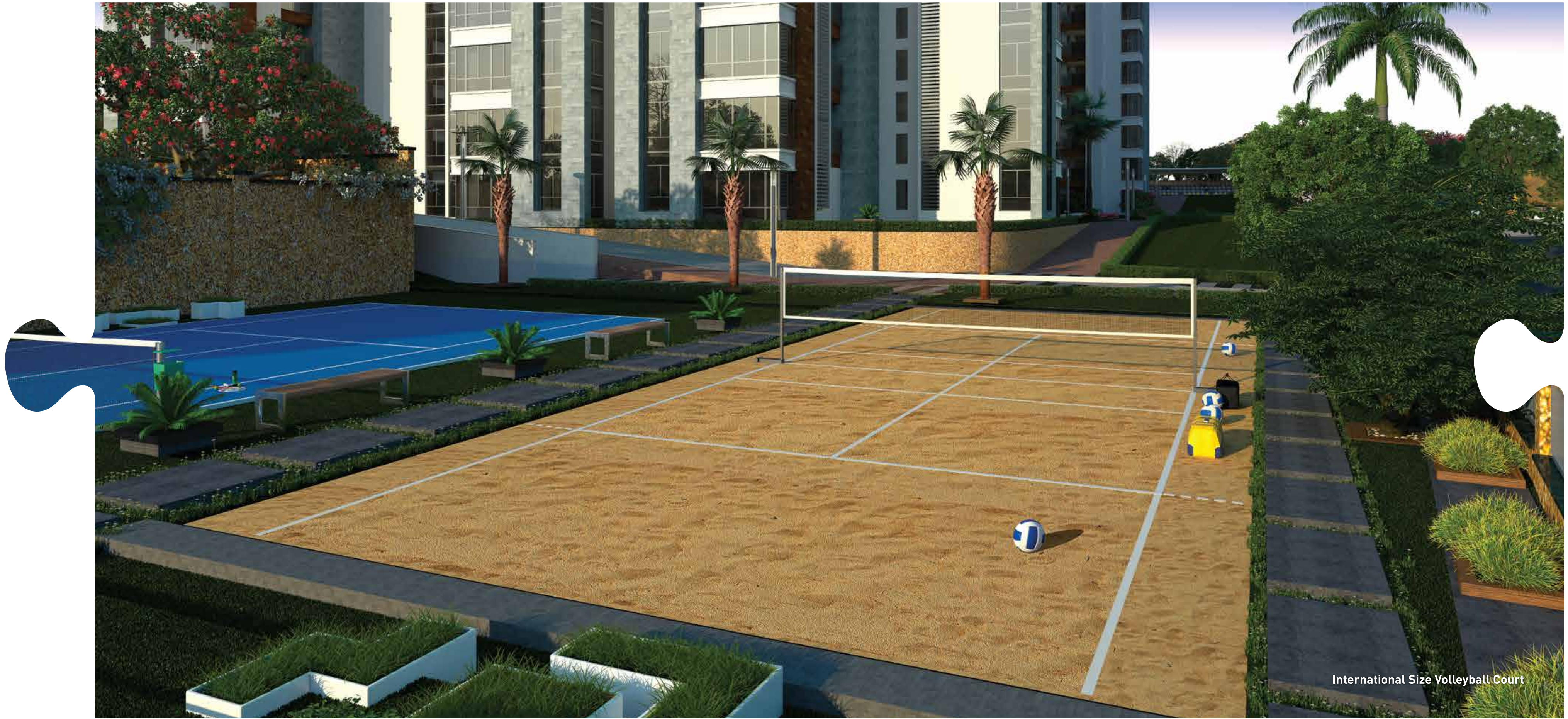
International Size Volleyball Court