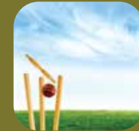
ICC Standard Size 22 Yard Cricket Pitch