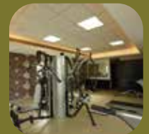
Internationally Approved Equipments