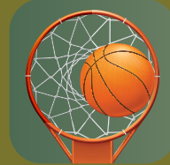
US NBA Jr. School Approved Size Court